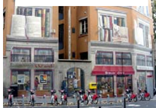
Murs peints Lyonnais

12.00 am - Lunch at restaurant "La Villa Florentine"