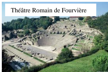
Théâtre Romain de Fourvière

09.45 am - Visit of the old district of Lyon